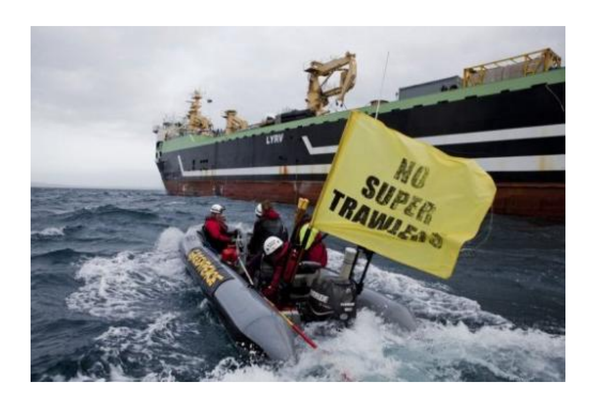
Image provided by Greenpeace shows activists on an inflatable boat blocking Dutch super-trawler FV Margiris' attempt to enter Port Lincoln in South Australia on August 30. The trawler was Tuesday given the go-ahead to fish in Australian waters but with tough conditions to minimise by-catch such as dolphins, seals and sea lions.

A huge Dutch super-trawler was Tuesday given the go-ahead to fish in Australian waters but with tough conditions to minimise by-catch such as dolphins, seals and sea lions.