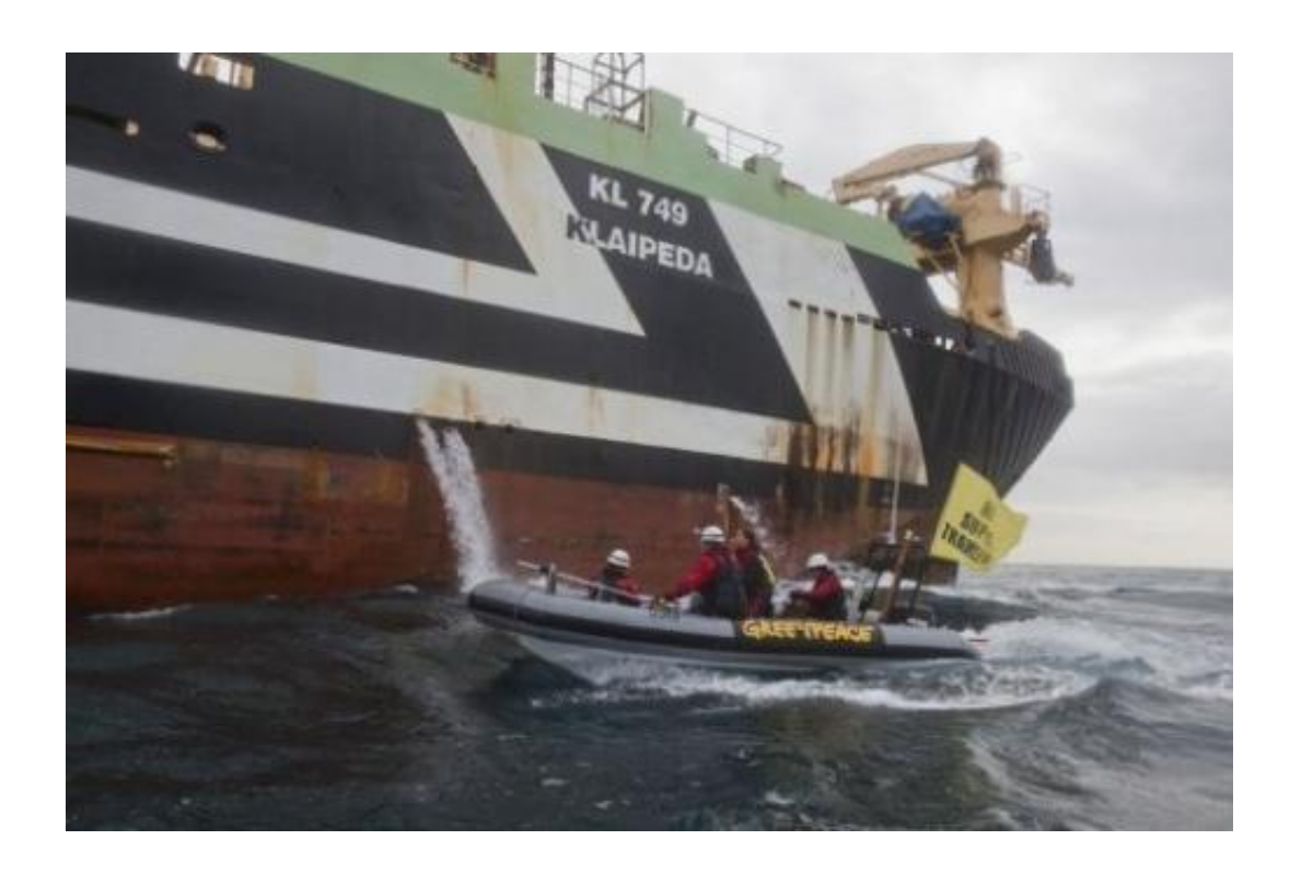
Image provided by Greenpeace shows activists on an inflatable boat blocking Dutch super-trawler FV Margiris' attempt to enter Port Lincoln in South Australia on August 30. The trawler's operators would have to prove they were doing everything necessary to minimise by-catch.

The 143-metre (469-foot) Margiris sparked protests among conservation groups and local <u>fishermen</u> when it was announced earlier this year that it would fish off Tasmania.