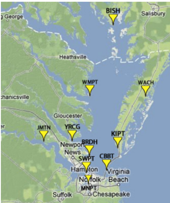
The 10 Tidewatch water-level stations.

What sets the Tidewatch forecasts apart, says Boon, is its third component: inclusion of a 30-day running average of the observed water level denoted as m30. When m30 is added to the predicted tide and their sum subtracted from the observed water level, a difference that meteorologists and oceanographers call the “residual” results, viewed in Tidewatch through a moving 30-day window. Changes in the size and sign of the residual produce what Boon terms the “sub-tidal oscillation,” which Tidewatch shows in near-real time.