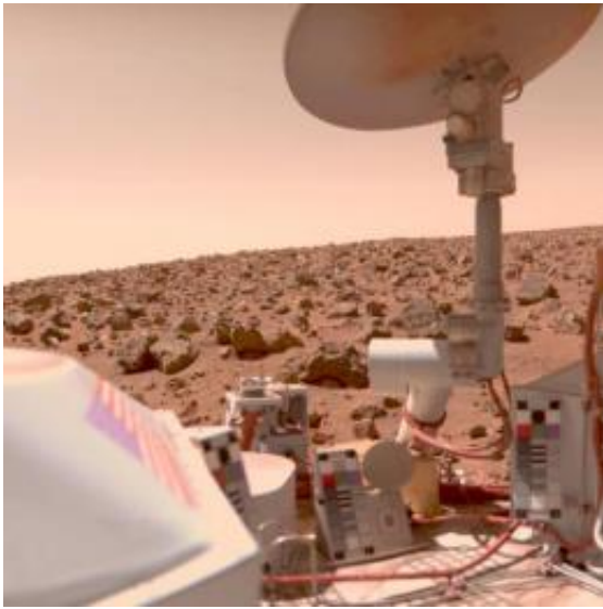
Viking lander on Mars.