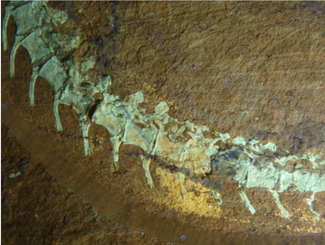
Mid-tail section of Sciurumimus under ultraviolet light, showing patches of preserved skin (yellow) and fine filaments (bluish lines above the vertebrae).

The fossil , which is of a baby Sciurumimus , was found in the limestones of northern Bavaria and preserves remains of a filamentous plumage, indicating that the whole body was covered with feathers. The genus name of Sciurumimus albersdoerferi refers to the scientific name of the tree squirrels, Sciurus , and means "squirrel-mimic"—referring to the especially bushy tail of the animal. The species name honors the private collector who made the specimen available for scientific study.