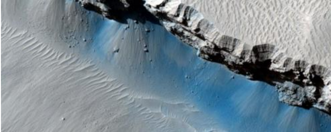
Boulders on the floor of Cerberus Fossae.

Compared to Earth, Mars is a relatively quiet planet, geologically speaking. Actually, very quiet, as in pretty much dead. While it has volcanoes much larger than any here, they have been inactive for a very long time; the latest studies suggest however that volcanic activity may have continued until only a matter of millions of years ago. That seems like an eternity to our human sense of time, but geologically, it is quite recent.