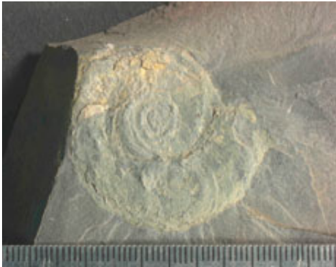
Fossilised nautiloid with a curved shell.