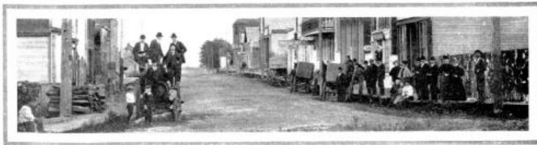
Main Street of The Village of a Thousand Souls