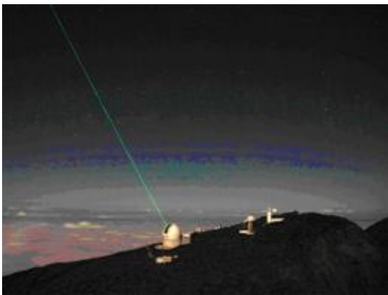
The William Herschel telescope at Roque de Los Muchachos, La Palma (Canary Islands), and laser shot.

Observation of the first stars and galaxies that formed in the early Universe , 800 million years after the big bang , requires a really large telescope. ESO's European Extremely Large Telescope (E-ELT) will have a mirror 42 meters in diameter and will be built at an altitude of 3060 meters in the Atacama Desert in Chile. However, like all its ground-based counterparts, it will inevitably undergo the effects of atmospheric turbulence , which blurs images and reduces their contrast and resolution. To correct such distortions, it will need to be equipped with a technology known as adaptive optics. This works by using a deformable mirror that compensates in real time the early or late arrival of wavefronts of light after they propagate through the atmosphere. But this could only work over a very narrow field of view until now. However, in order to survey the early Universe in detail, astronomers need fields of view that are at least ten times wider.