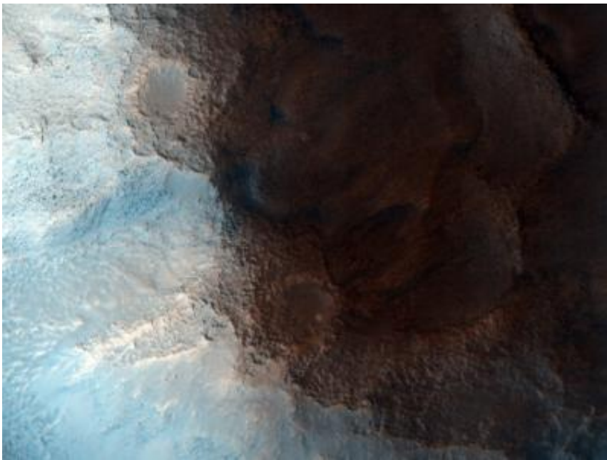
2007 HiRISE image.

Taken from much nearer to the planet and with a substantially higher resolution camera, the features so distinctive in the original image completely vanish in the new one. The original Viking Orbiter image had much lower spatial resolution and a different lighting geometry, factors that led to the optical illusion.