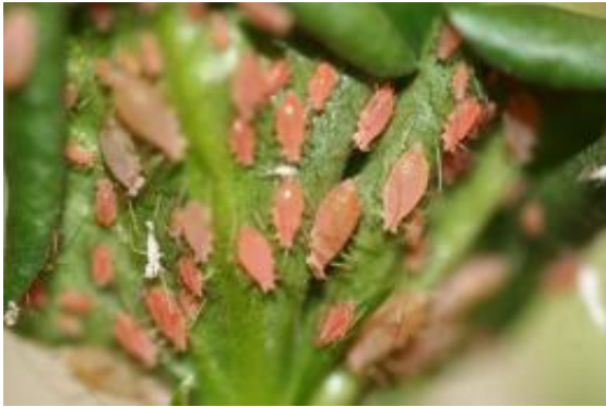
A colony of pea aphids, Acyrthosiphon pisum.

(PhysOrg.com) -- Conventional thinking says that animal immune systems have evolved to defend against harmful microorganisms, but a new Cornell study examines the role of friendly bacteria in shaping animal immunity.