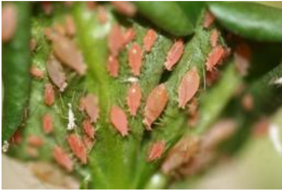
A colony of pea aphids, Acyrtosiphon pisum.

(PhysOrg.com) -- Conventional thinking says that animal immune systems have evolved to defend against harmful microorganisms, but a new Cornell study examines the role of friendly bacteria in shaping animal immunity.