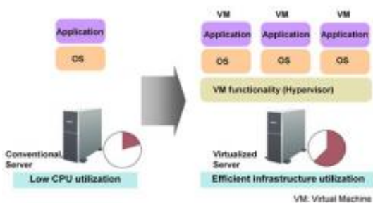
Figure 1: Infrastructure optimization through server virtualization

Fujitsu Laboratories today announced the development of technology for use in virtual cloud computing networks that manages virtual switching functionality - which has traditionally been handled using server-level software - using dedicated external switching hardware. This new technology is the world's first such technology to run at 10 Gbps while supporting standard protocols.