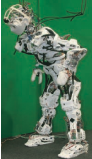
Kojiro seen here bending forward.