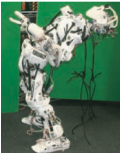
Kojiro seen here bending backward.

Since safety was a key concern, researchers built the robot's body using