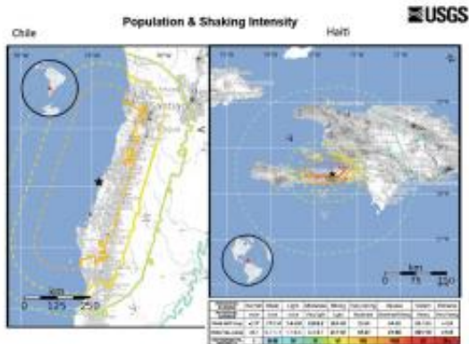
A USGS map of the Chilean quake.

Pictures of widespread devastation leave no doubt: Last month's 8.8 magnitude earthquake in coastal Chile was extremely strong. Indeed, say NASA scientists, it might have shifted the axis of Earth itself.