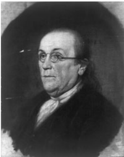
Benjamin Franklin.

Birch was a colorful figure and an important man in his own right - a member of the Society of Antiquaries of London and secretary of the Royal Society from 1752 to 1765- but he "doesn't show up in any of the biographies on Franklin," Houston said.