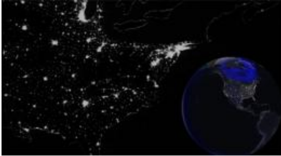
Artist rendition of the 1989 blackout.