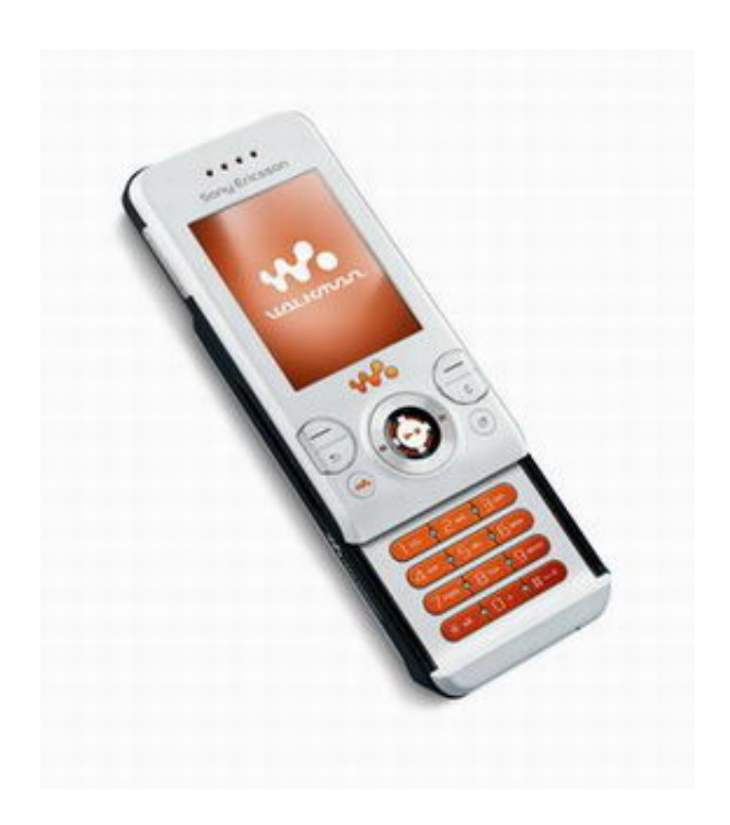
Sony Ericsson W580

Like the W800, the W580 has an MP3 player that plays all the popular unprotected music formats from a Memory Stick M2 card. Other impressive features include a 2-inch, 320x240 screen, real HTML Web browser, pedometer, FM radio, and built-in high-end games including The Sims 2. All this comes in a package only .56 inches thick and weighing 3.35 ounces. The W580 is a quad-band EDGE phone, so it will work on Cingular or T-Mobile networks.