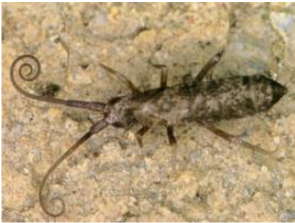
Tomocerus longicornis found in Europe