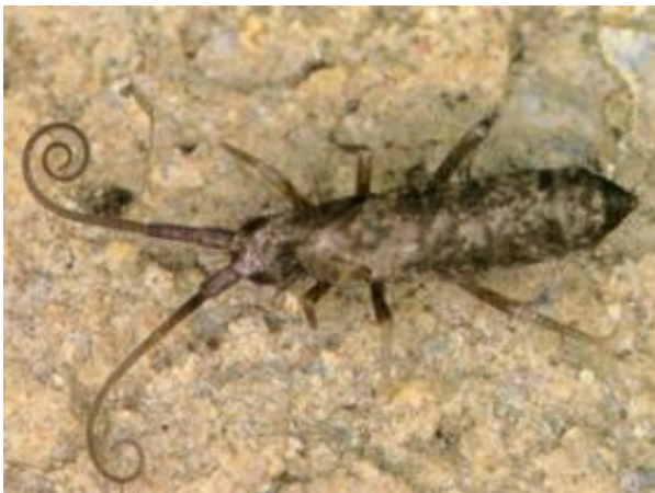
Tomocerus longicornis found in Europe