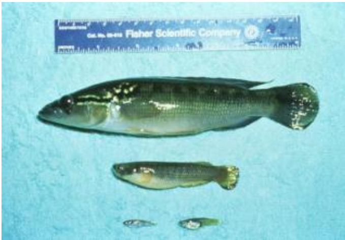
Image: The fish at the top is the pike cichlid, Crenicichla alta . It is one of the key predators in high-predation localities. The middle fish is the killifish Rivulus hartii . It is the only predator that co-occurs with guppies in low-predation sites. The fish on the bottom left is an adult male guppy while the one on the bottom right is an adult female guppy.

A UC Riverside-led research team has found that as some populations of an organism evolve a longer lifespan, they do so by increasing only that segment of the lifespan that contributes to “fitness” – the relative ability of an individual to contribute offspring to the next generation.