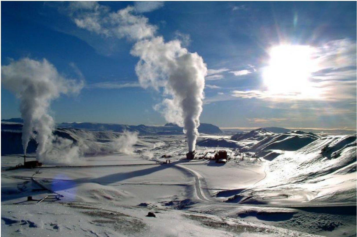
The Krafla a geothermal power station located in Iceland.

wind turbines, and other equipment – not to mention improvements made in the amount of energy produced – has resulted in many forms of alternative energy becoming competitive with other methods. All over the world, nations and communities are stepping up to accelerate the transition towards cleaner, more sustainable, and more self-sufficient methods.