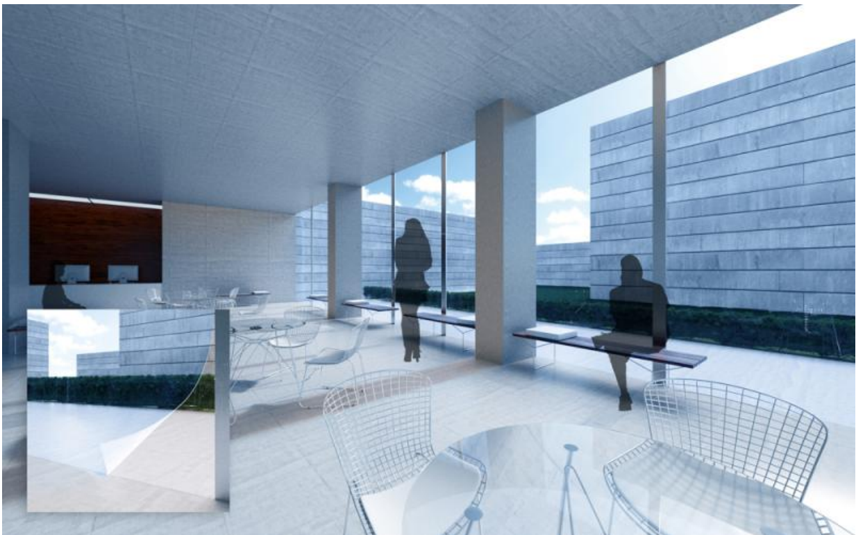
Window tinting tuned to a cooler color sunlight transmission.