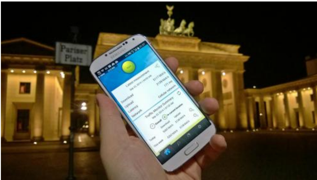
A user with Netrarad in Berlin, Germany.