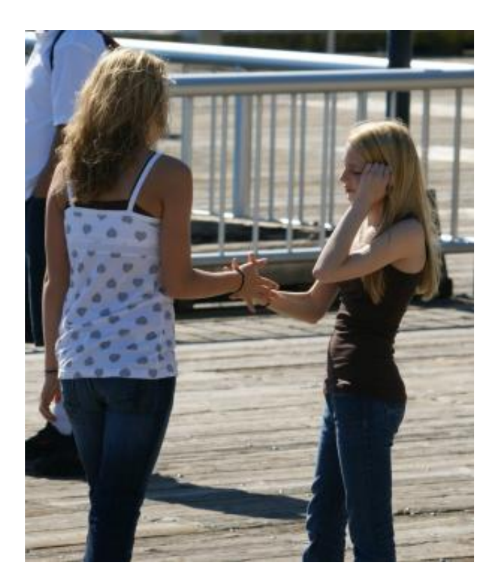
'Don't forget to sniff!'

In turn, men find women's armpit odour more attractive when women are close to <u>ovulation</u> and exposure to vulvar scents collected around ovulation increases their testosterone levels, suggesting that scent might <u>prime men for competition</u> over a fertile woman. Interestingly, women respond to fertile odour in just the same way, suggesting they are also sensitive to smells of <u>potential competitors</u>.