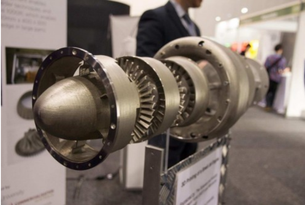
The 3D printed jet engine on display.

Monash University researchers along with collaborators from CSIRO and Deakin University have printed a jet engine. In fact Monash and their spin-out company Amaero, have printed two engines. One is on display this week at the International Air Show in Avalon, while the second is displayed in Toulouse at the French aerospace company Microturbo (Safran).