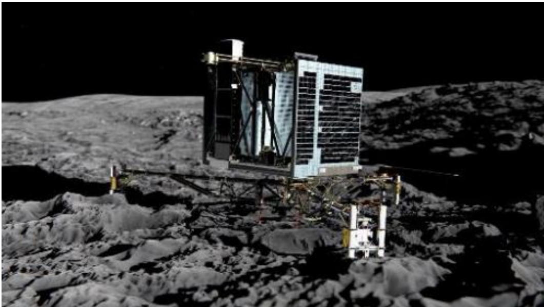
Photo released by the European Space Agency shows an artist impression of Rosetta's lander Philae (back view) on the surface of comet 67P/Churyumov-Gerasimenko