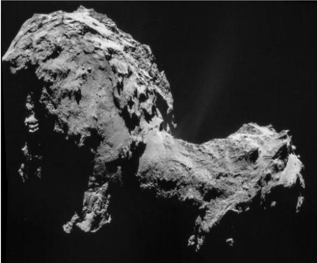
Photo released on September 19, 2014 by the European Space Agency shows a four-image NAVCAM mosaic of Comet 67P/Churyumov-Gerasimenko

"Then it's a very gentle freefall for the next seven hours," said Sylvain Lodiot, in charge of flight operations.